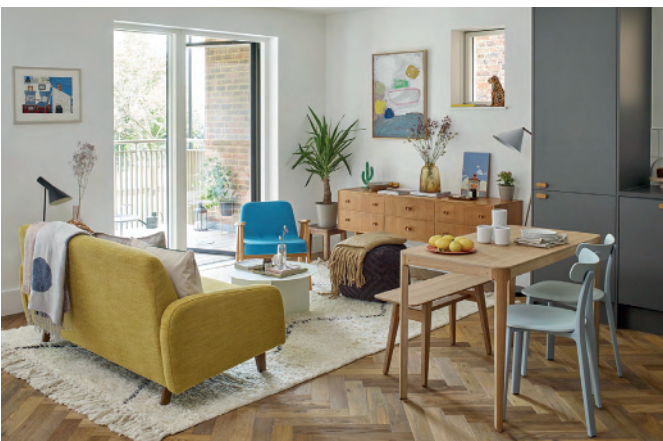
Photographs from a different Brick By Brick scheme, some finishes may vary.