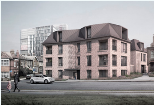
Coombe Road, Croydon, 9 homes