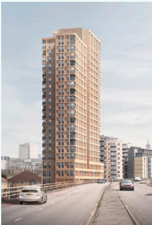
Kindred House (Wandle Road Car Park) Croydon, 128 homes