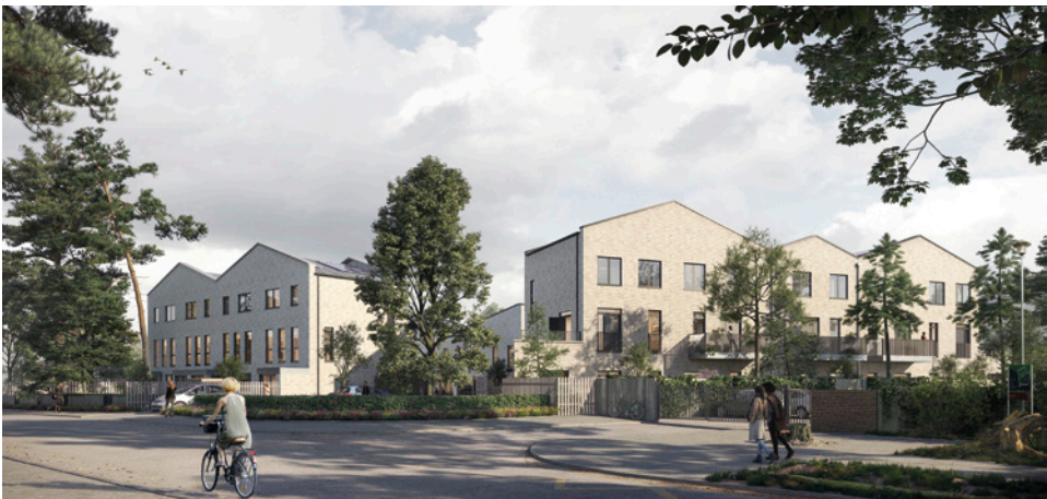
Windmill Place Coulsdon 24 homes

The company's development model continued to operate on the basis of identifying land with development potential onto which viable schemes can be developed by Brick by Brick upon acquisition from LB Croydon. The terms of the purchase of these sites are designed to ensure that the Council secures best consideration in terms of the value of the land, including the capture of land value from favourable future market conditions via overage arrangements that guarantee that the Council gets 100% of any increase.