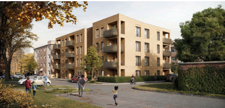
Auckland Rise & Sylvan Hill Upper Norwood 57 homes